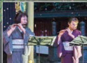
Bamboo flute performance